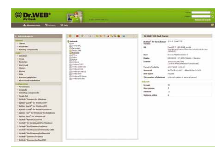
Web administration interface

Service Providers can add their logo to such notifications to show users who sent the notification