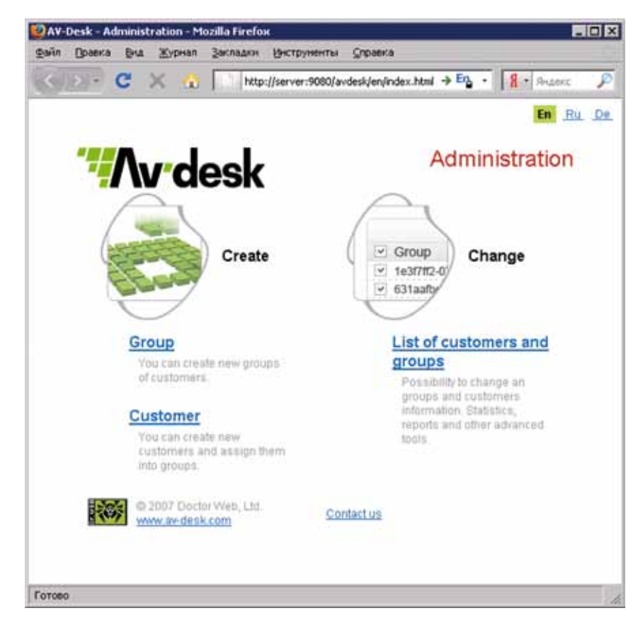
Dr.Web AV-Desk web-console

A unique installation package is generated for every customer during the subscription. The generation of packages can be performed manually by a system administrator or automatically. Automated registration and a subsequent transfer of the Dr.Web installation file allows a user to establish anti-virus protection with one click.